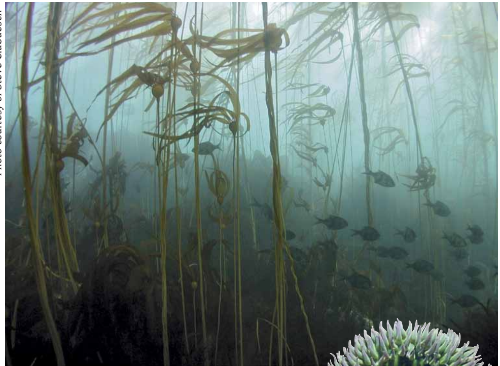
Marine life abounds in the waters off Salt Point. Above: bull kelp forest; right: anemone.