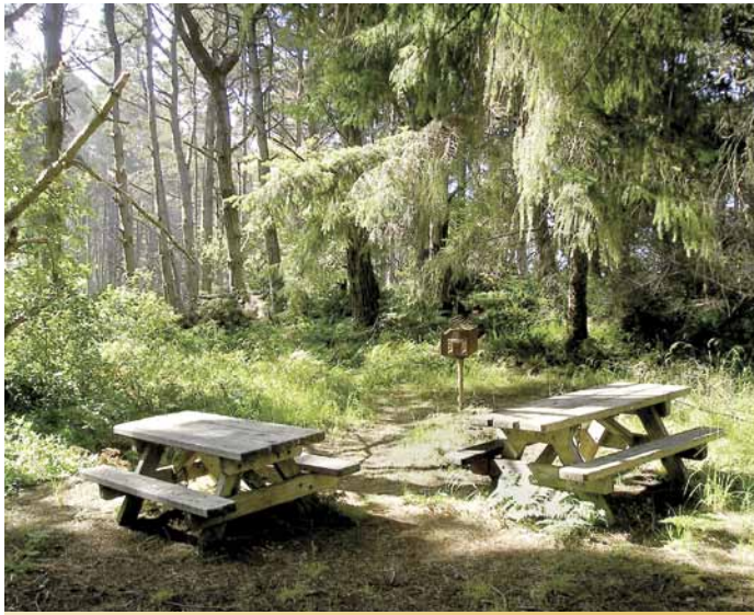
Fisk Mill picnic area

Picnicking —Fisk Mill Cove, a day-use area with paved parking, picnic tables, upright barbecues, restrooms and drinking water, is shielded from the wind by Bishop pines. For a dramatic view of the Pacific Ocean, take a short walk from the north parking lot to Sentinel Rock's viewing platform. Stump Beach, one of the few sandy beaches north of Jenner, has some picnic tables near the parking lot and a primitive toilet, but no running water. A 1/4-mile trail leads to the beach. Gerstle Cove also has picnic tables, a primitive toilet and a scenic view of the ocean.