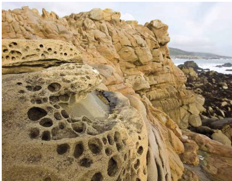
Tafoni formations in sandstone

Diving —Salt Point's rocky coastline attracts abalone divers. Abalone collection is highly regulated. People taking abalone need a valid California fishing license and abalone report card. Additional rules apply regarding minimum size, daily bag and possession limits, tagging and reporting. For more information on abalone and fishing regulations, contact the Department of Fish and Game or visit www.dfg.ca.gov .