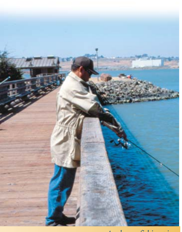
Angler on fishing pier

Recreation Area, panoramic views of San Bruno Mountain, the East Bay Hills and San Francisco Bay give visitors a sense of solitude and relaxation. Its location on the western shoreline of the bay surrounded by millions of urban dwellers—provides a great variety of recreational opportunities, from fishing to windsurfing to strolling. The walking trails, open lawns, and fishing piers at this 252acre park offer a chance to get away from it all, answering the human need for fresh air, open space and wholesome leisure activities.