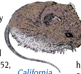
California pocket mouse

dusky-footed wood rats and pacific gopher snakes. Song sparrows, rufous-sided towhees, American kestrels, red-tailed hawks and Anna's hummingbirds are common.