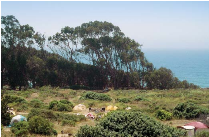
Walk-in campsites at Manresa State Beach

The mission system forever changed the lives of the Ohlone. The effect on their culture and traditions was disastrous, and their numbers were nearly decimated by exposure